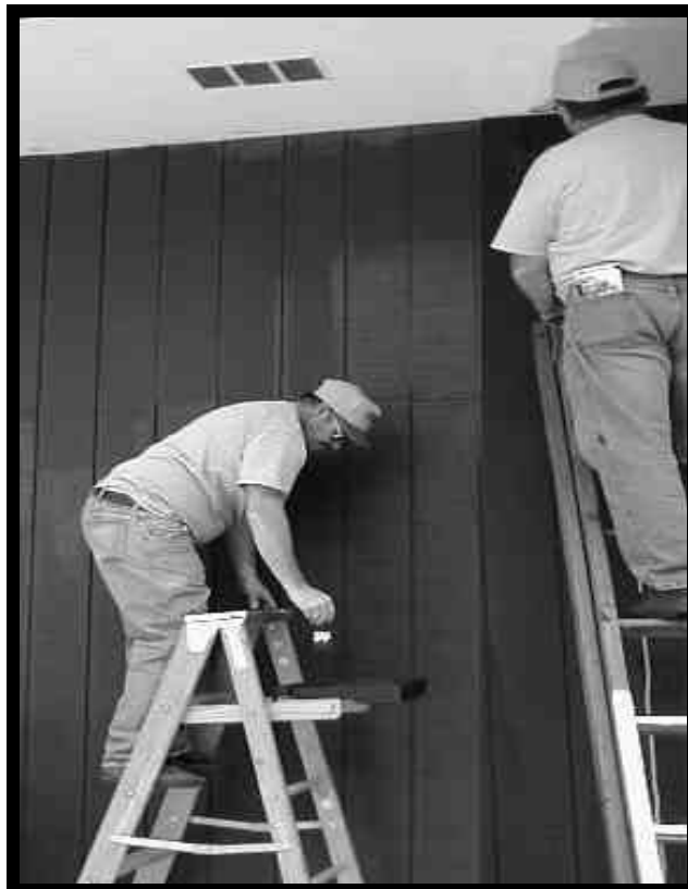
Cheerful Service. Willit's Dining Hall gets a fresh coat of paint by some Lodge Brothers.