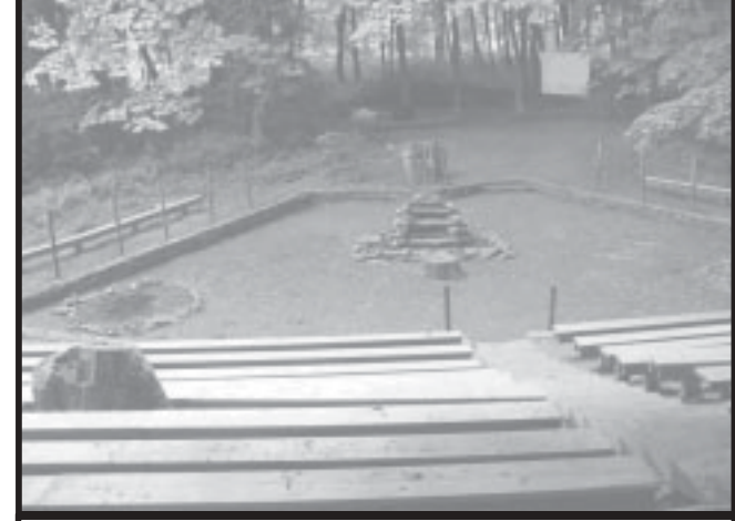
The Beginning - Pictured above is the birthplace of our great brotherhood. Over 87 years ago, two scouts successfully completed their ordeal. They were then led to these grounds, located on Treasure Island, were they completed three different task - each one representing the ideals of the new society. After completing each task successfully, they then earned the black sashes with white bars of the order. Thus the beginning of a great society that each one of us belongs to.