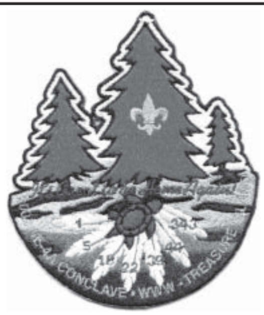
2002 NE-4A Conclave Patch

display went on for about 15 minutes and was quite the sight to see on Treasure Island.