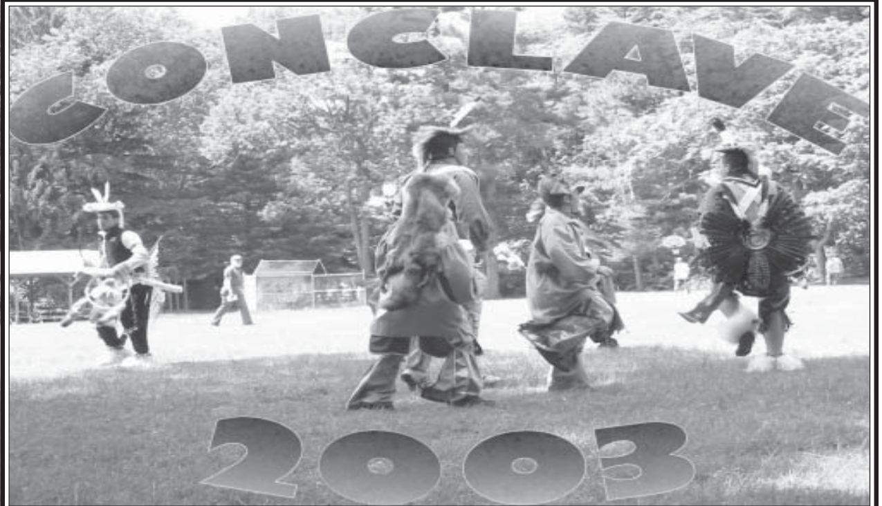
Dance competitors at last year's Conclave at Treasure Island. Rumor has it Kittatinny will be trying to put a dance team together sometime this year. If you are interested in joining, let us know.

Page 4 - Deadlines, Activities, Lodge Directory, Conclave Form, May Form