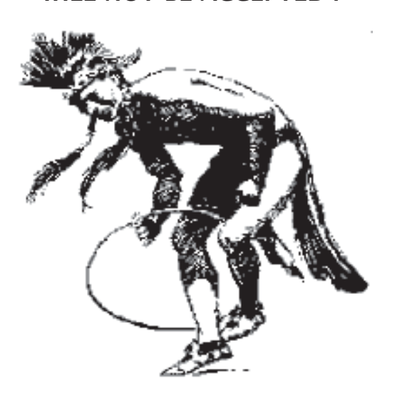
Get Wolf's Tale on-line plus more at: http://www.kittatinny5.org

WE WON'T JUMP THROUGH HOOPS FOR YOU - LATE ARTICLES WILL NOT BE ACCEPTED!