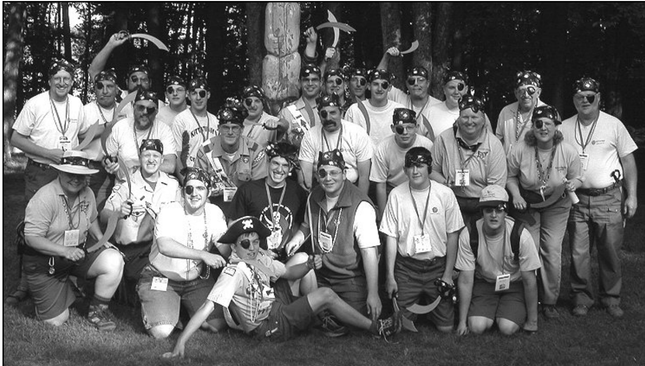
The Kittatinny V contingent proudly poses for a Publications photo op during the 2004 Section NE-4A Conclave. The event was held June 11-13 at Camp Minsi, near Pocono Summit, PA.