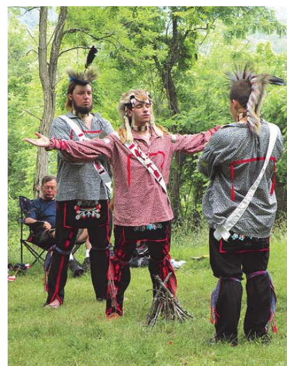
Our ceremony presentation