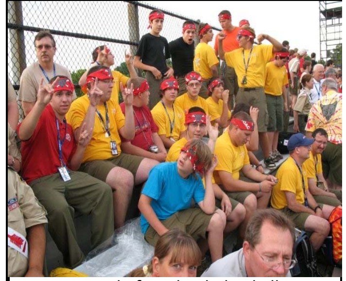
Kittatinny 5-before the dodge ball game