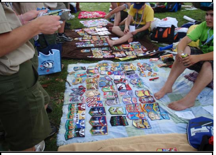
Lots and lots of patches!