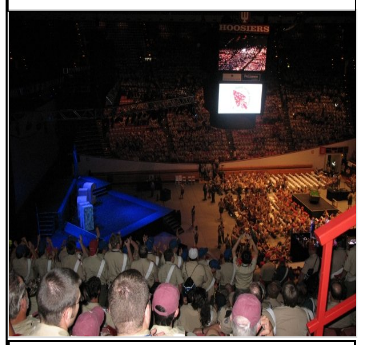
The nightly NOAC show