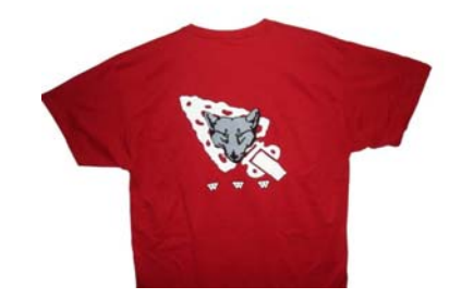
Lodge Shirt- $10.00 (S, M, L, and XL.) $12.00 (XXL., XXXL.)