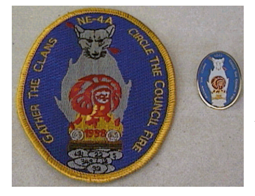
The object of desire: the Conclave patch and pin!

cook a good meal for a camping trip. They used such common household items as an empty can of nuts to make a reflector oven for roasting chicken. They also showed how to cook a sweet potato in aluminum foil, make pineapples, cherries, and Spam into kabobs, and using sodas such as Sprite and Coke in cakes. I hope that Wunita Gokhos' unique ideas can help you in the future.