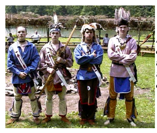
Lodge 18's ceremonies team stands ready to compete

The winner of the Ironman will be announced at the section meeting after church tomorrow morning.