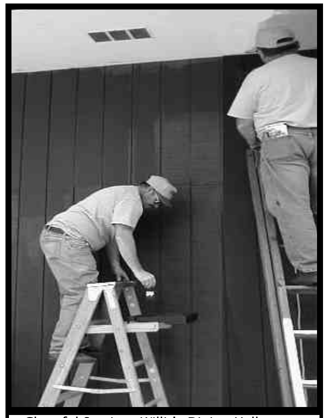
Cheerful Service. Willit's Dining Hall gets a fresh coat of paint by some Lodge Brothers.