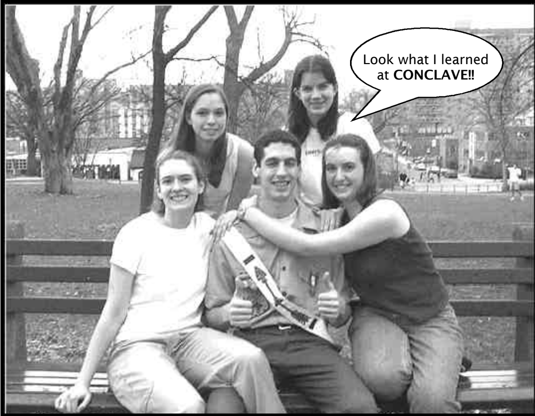
Editor's Note: No, you really can't learn this at the OA Section Conclave, and we can't guarantee your popularity as a result of attending either, but could it hurt? This message brought to you by the Conference/Conclave Committee. Are you going to Conclave?