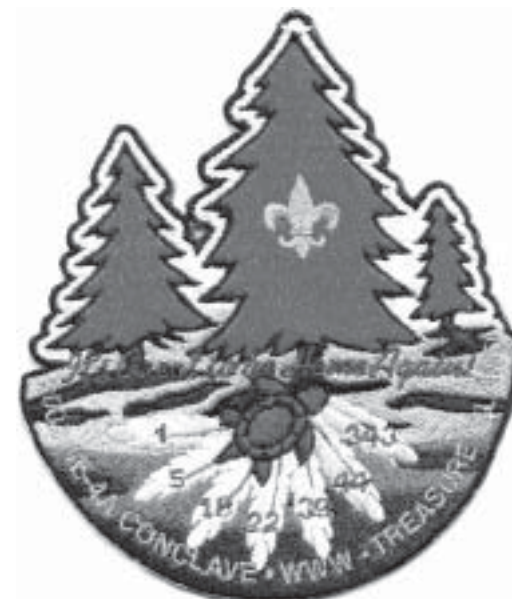
2002 NE-4A Conclave Patch