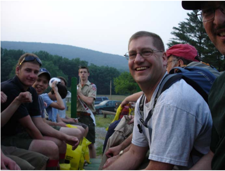
Wagon Trip to our Site