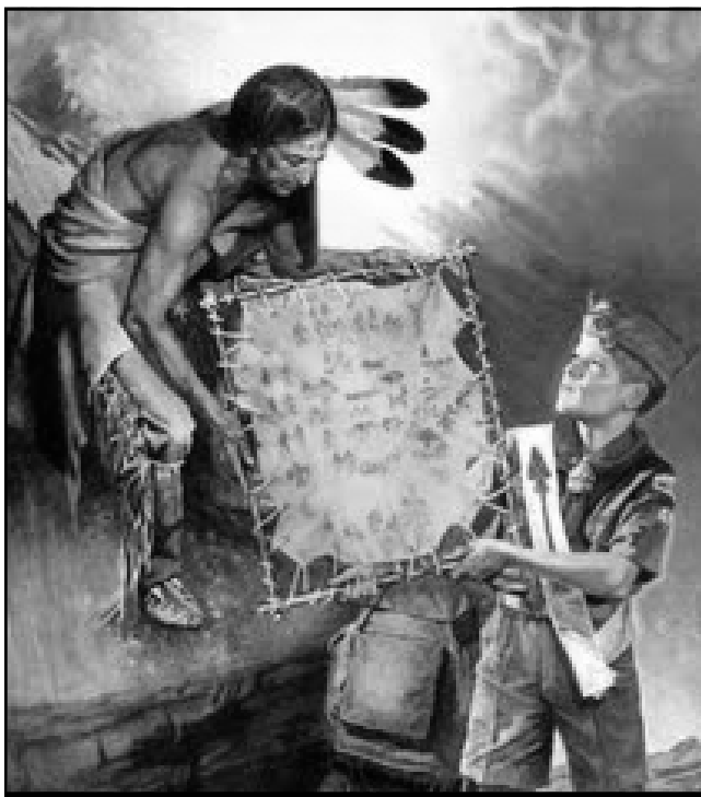
The legend of the Order of the Arrow is passed down from Scout to Scout during each O.A. Ceremony. Do YOU know the legend?