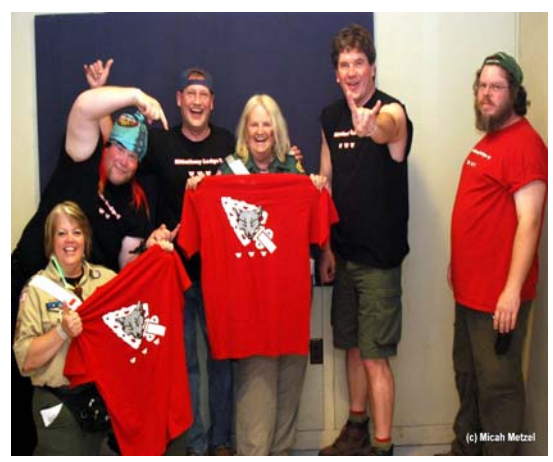
(Youth Rock Band)

Lodge Leadership Directory, Article Deadlines, Brotherhood Sign Up Form, & September Service Weekend Registration Form