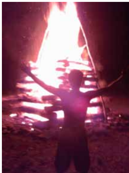
This is getting really hot!