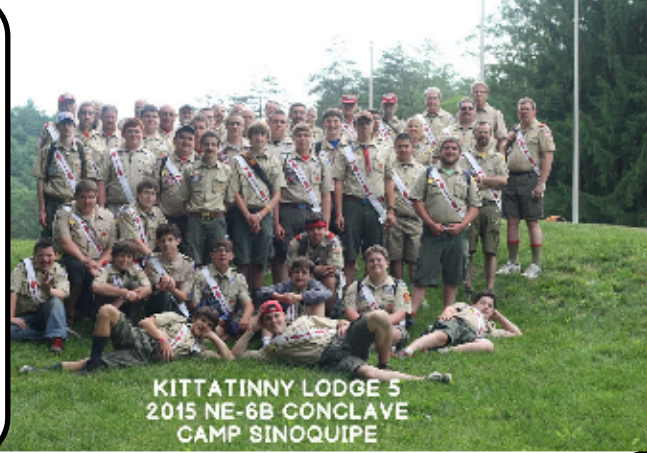
KITTATINNY LODGE 5 2015 NE-6B CONCLAVE CAMP SINOQUIPE