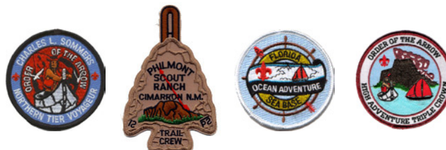
The four Order of the Arrow High Adventure patches (from left to right) Northern Tier, Philmont, Florida Sea Base, High Adventure Triple Crown.