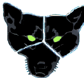
The Kittatinny Award Kittatinny Award patch (top) and the three Kittatinny Award segment pins (left)