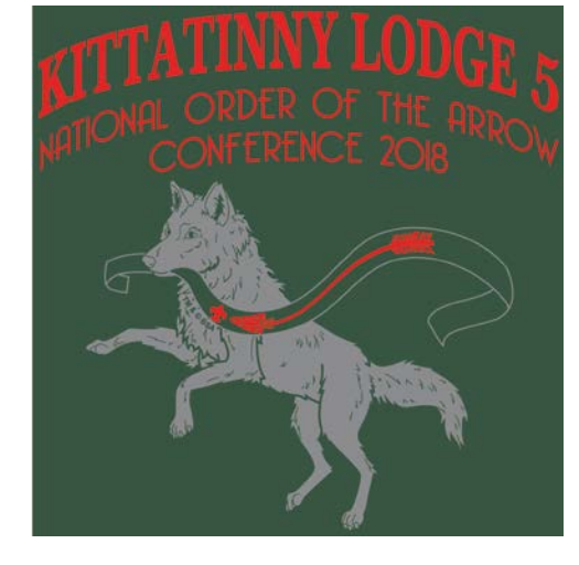
Shirt Logo (back)