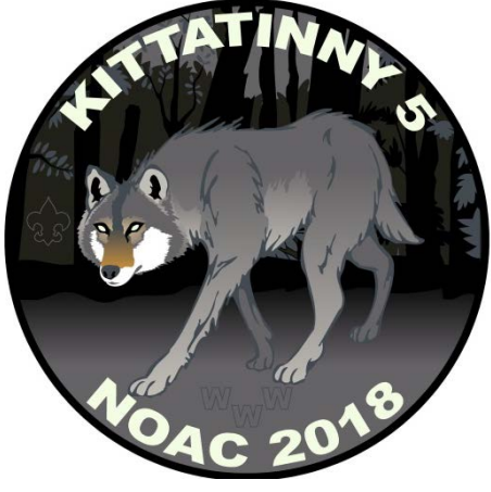
Back Patch (Glow in the dark eyes!)